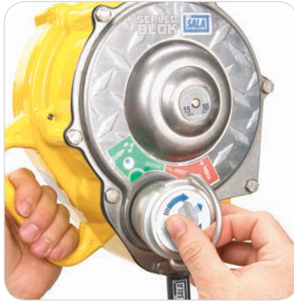
FALL ARREST MODE Assisted Rescue by Hand