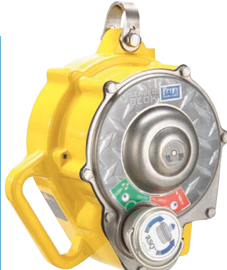
Model Shown 3400930