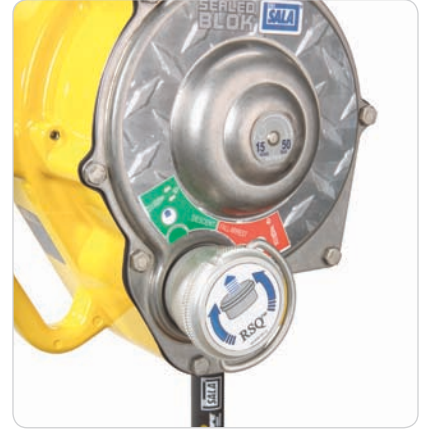
AUTOMATIC DESCENT MODE Self Rescue/Descent