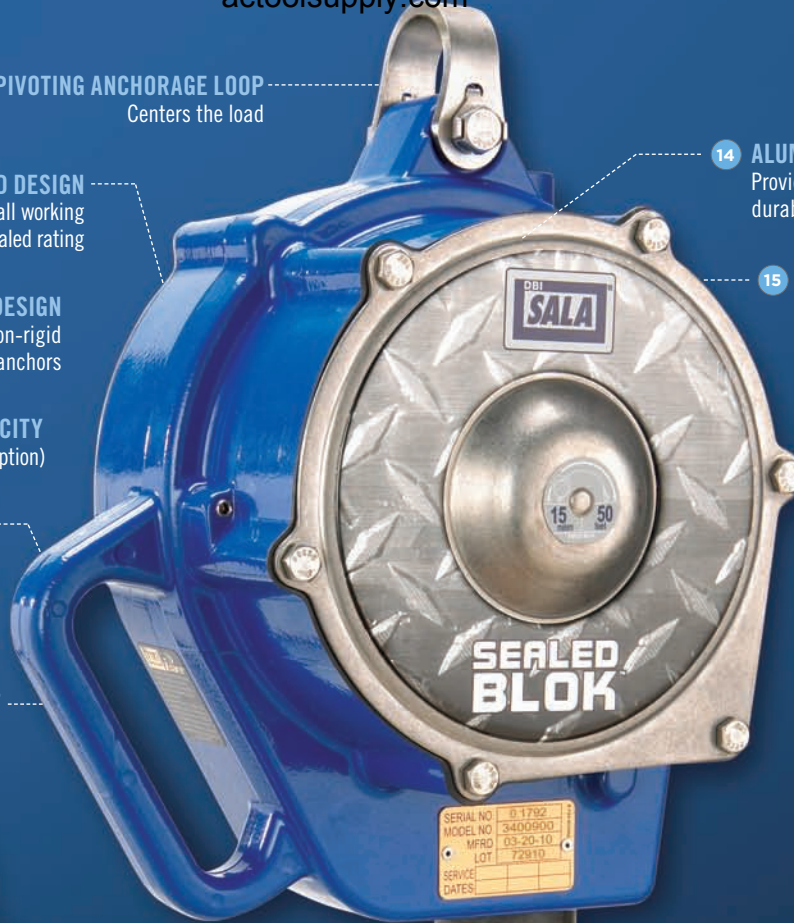
Model Shown 3400900

15 STAINLESS STEEL END-PLATE Improves durability and corrosion resistance