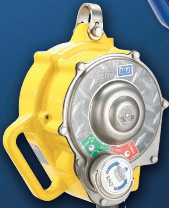
Model Shown 3400930

10 3600 LB. GATE Reduces chances of accidental disengagement (“roll-out”)