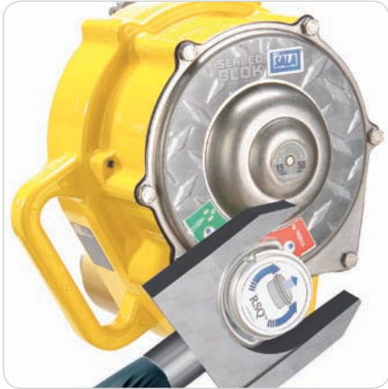
FALL ARREST MODE Assisted Rescue by Pole

Traditional assisted rescue operations may also be conducted.