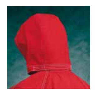
SAWYER TOWER POLYESTER HOOD #66-664