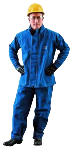
SAWYER TOWER NOMEX® JACKET #66-670