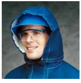
SAWYER TOWER NOMEX® HOOD #66-674