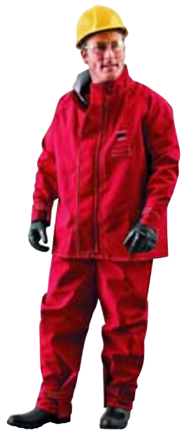
SAWYER TOWER POLYESTER JACKET #66-660