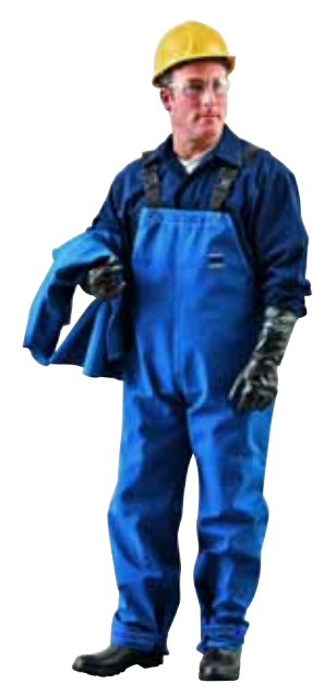
SAWYER TOWER NOMEX® BIB OVERALL #66-672