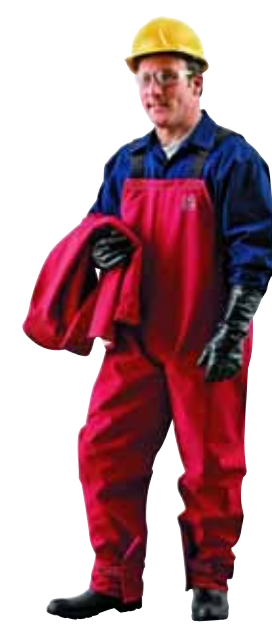
SAWYER TOWER POLYESTER BIB OVERALL #66-662