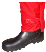
Ankle hook and loop closure