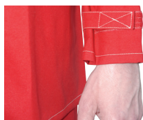
Wrist hook and loop closure