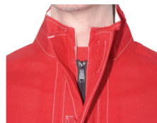
Double front flap hook and loop closure