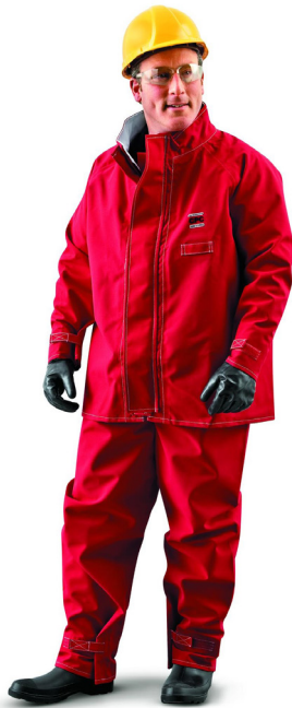
SAWYER-TOWER™ Jacket, made of Gore® Chemical Splash fabric, Polyester version. 66-660.

IT'S YOUR LIFE. IT'S OUR JOB TO HELP PROTECT IT.