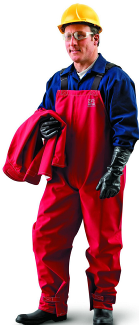
SAWYER-TOWER™ Bib Overall, made of Gore® Chemical Splash fabric, Polyester version. 66-662.

SAWYER-TOWER™ is not just any workwear. It is protective clothing for industrial everyday work. Workwear combining outstanding comfort with advanced chemical protective properties.