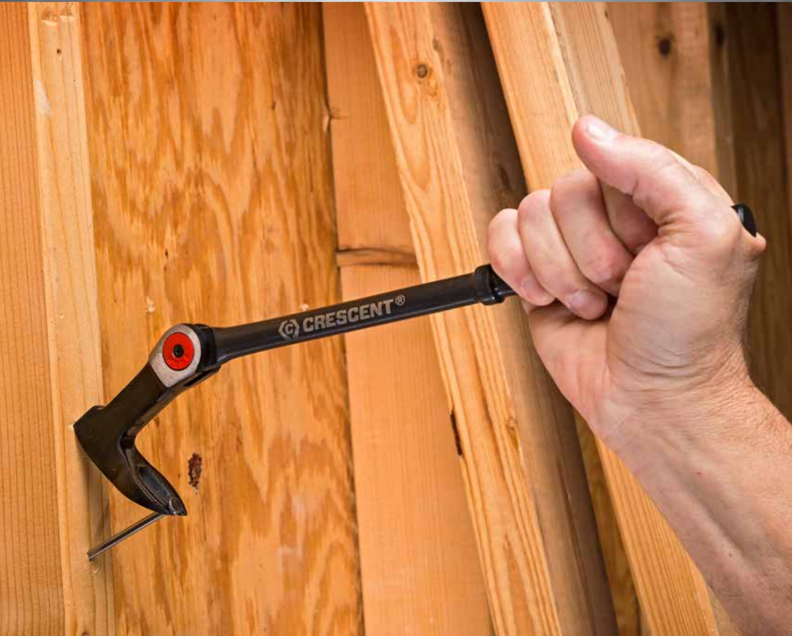
Indexing Nail Puller