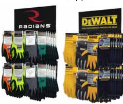
9525 Works as a Wall (48 Pairs) or Table Top (24 Pairs) Display, Available for Radians or DEWALT