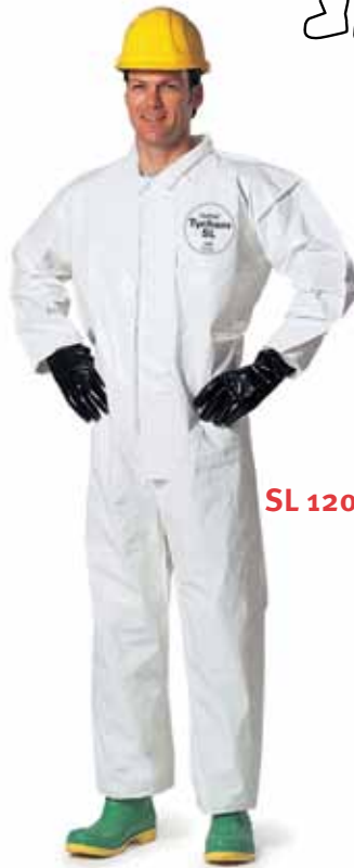
SL 120 T