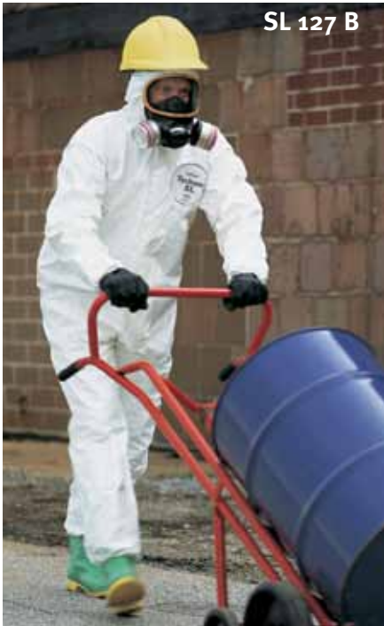
SL 127 B