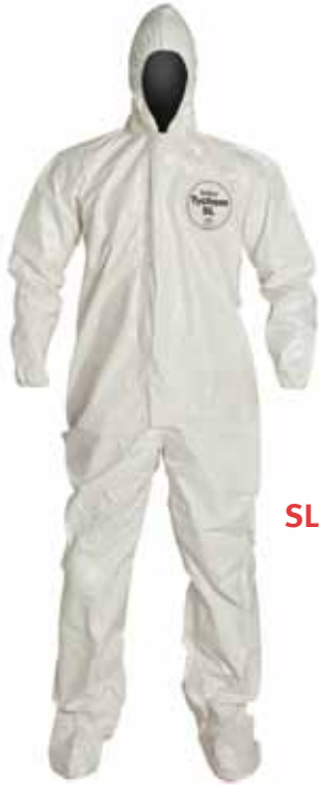
SL 122 T