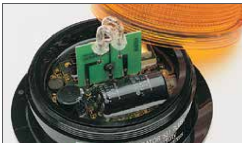
Heavy Duty Pulsator models use gel to protect complainants against vibration

Pulsator 551 Plus models are available in 10-joule (double & quad-flash) and 8-joule (double-flash), 12-48 VDC versions and 115 Volt (5-joule/single & double-flash) AC versions. All models use a helical strobe tube that is easily replaceable. All models include the necessary mounting hardware.