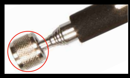
The PowerCap slides over the magnet, focusing its power and preventing the side of it attaching to other metal surfaces