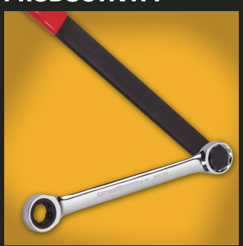
5° ratcheting box end not found on any other serpentine belt