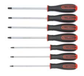
80073 — 7 Pc. Tamper Proof Torx® Dual Material Screwdriver Set - 6" Blades

Includes: T10, T15, T20, T25, T27, T30, T40