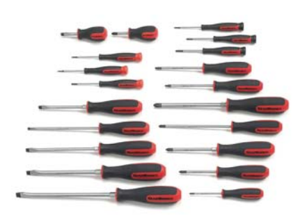
80066 — 20 Pc. Master Dual Material Screwdriver Set

Includes: PH#00, PH#0, PH#1 x 60mm, PH#0, PH#1, PH#2, PH#3, Slotted 1.5, 2.0, 2.5mm, Slotted 3/16", 1/4", 5/16", 3/8", Torx T15, T20