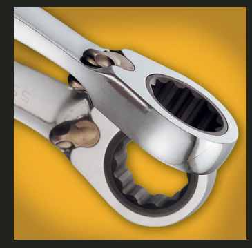
Dual access reversing levers allow you to switch from left to right without removing the wrench.