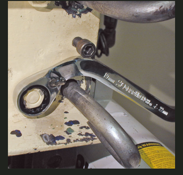
S-Shape provides ease in getting around tough obstacles.