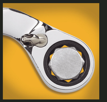
Surface Drive® provides a stronger grip on fasteners.