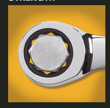
Surface Drive ® provides a stronger grip on fasteners.