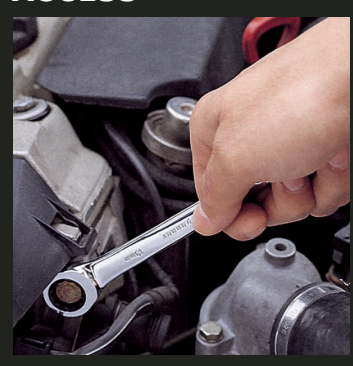
Sleek head design enables access to tight spots where a ratchet will not fit.