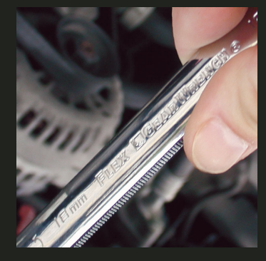
Serrated wrench beam allows you to feel which direction to pull.