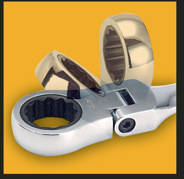
Flex Head tilts up to 180° at any interval.