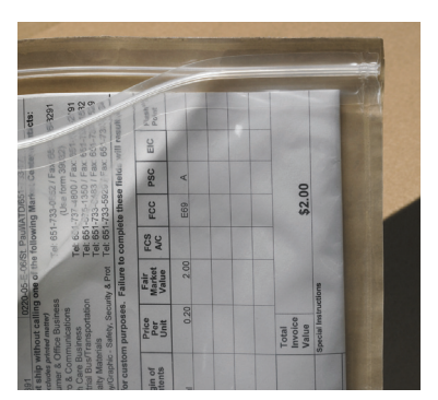
Tough construction resists moisture and abrasion. Available in two sizes, 8.5" x 11.5" or 10" x 12.5".