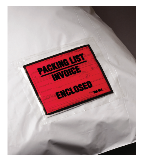
Secure adhesion — high tack, pressure sensitive adhesive on the back of the envelope grabs on contact and holds securely.