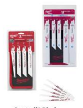
Sawzall® Blade Selection Guide Use the right blade to cut faster.

Super Sawzall blades are made with Matrix II high speed steel teeth containing 8 percent Cobalt to keep a sharper tooth edge longer. The tough Bi-Metal design allows faster cutting, longer life blades that can bend without shattering. Milwaukee designs and manufactures Sawzall blades for the toughest professional applications. Materials, tooth configuration and heat treating are designed to maximize performance in specific cutting applications. Durable, long life blades are the goal of every blade we make. This blade has a 1/2 inch universal tang that fits all Sawzalls and standard competitive saws. Includes five individual blades.