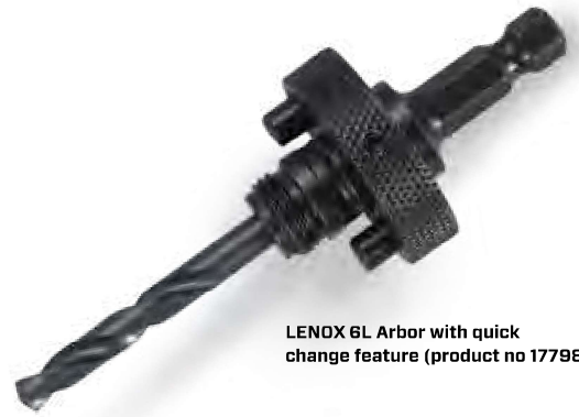
LENOX 6L Arbor with quick change feature (product no 1779805).

Split point pilot drill for faster penetration and less walking