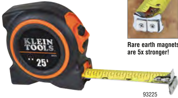
Rare earth magnets are 5x stronger!