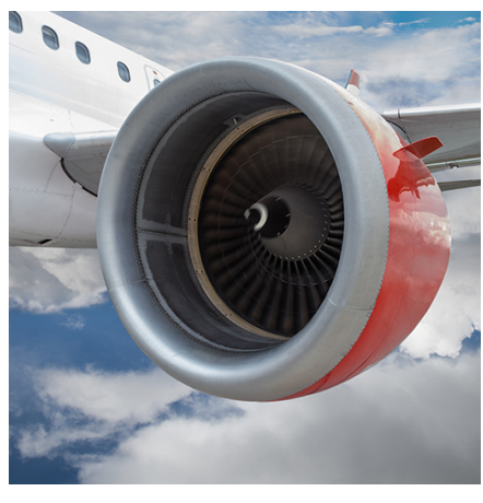
Hy-Speed Machining in Oregon, USA produces parts for the aerospace industry