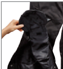
REMOVABLE PE FOAM KNEE PADS