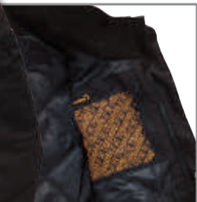
INTERIOR POCKET WITH HEADPHONE CORD PORT