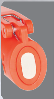
Integrated magnet built into the handle