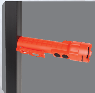
Hands-free magnet in base