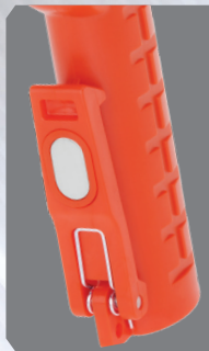
Built in pocket/belt clip with integrated magnet