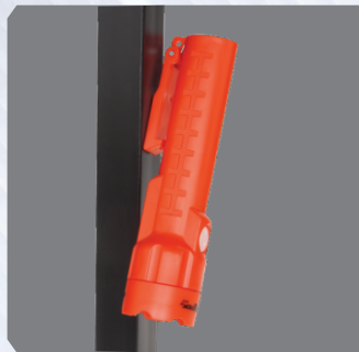
Hands-free magnet in clip