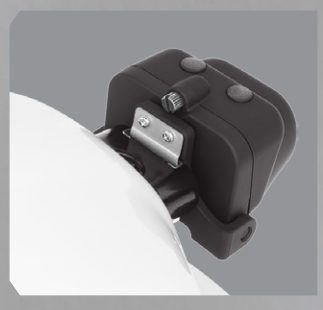
Tool-less secure pressure fit mounting