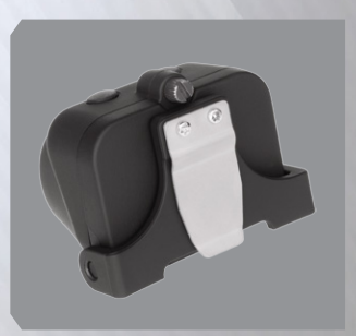
Integrated stainless steel clip