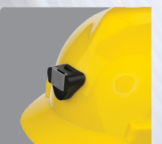
Fits most hard hats