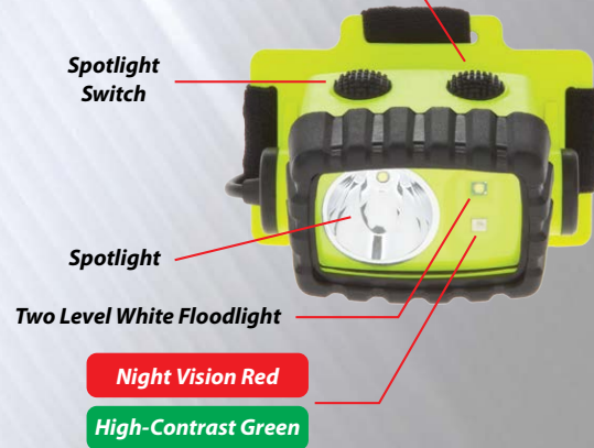
XPP-5456G White & Red Floodlight XPP-5458G White & Green Floodlight