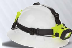
Rubber hardhat strap included