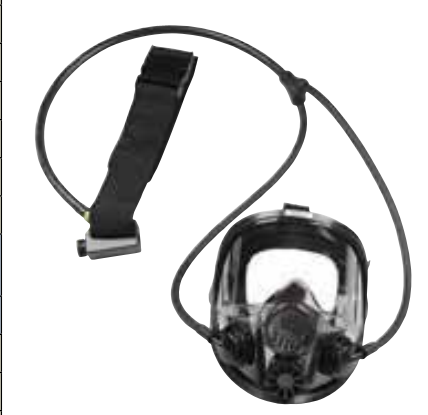
CF2007 with 760008A