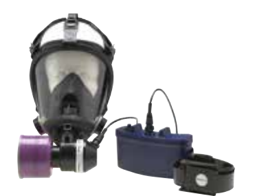
Opti-Fit with PAPR