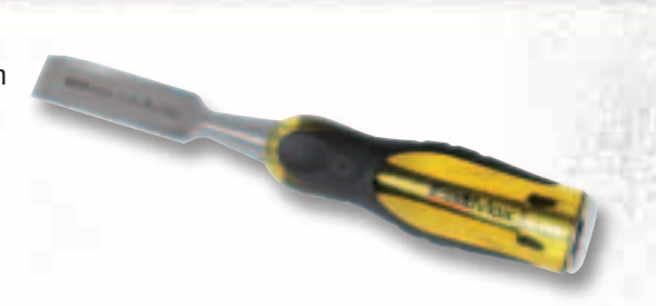
*Than Stanley® wood chisels