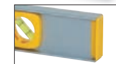
Shock-Absorbing End Caps