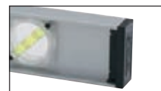
Shock-Absorbing End Caps