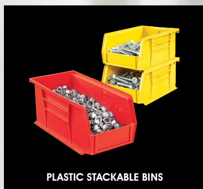
PLASTIC STACKABLE BINS