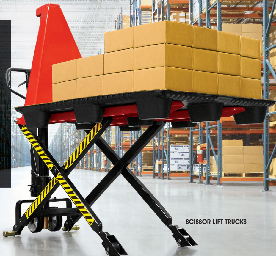
SCISSOR LIFT TRUCKS