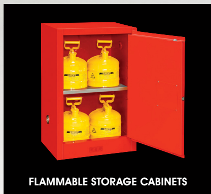
FLAMMABLE STORAGE CABINETS