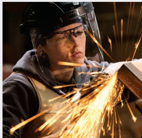
Photos taken at The Steel Yard - 27 Sims Ave, Providence, RI 02909